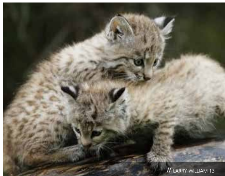
// LARRY WILLIAM 13

Learn more: www.openspacetrust.org/matching