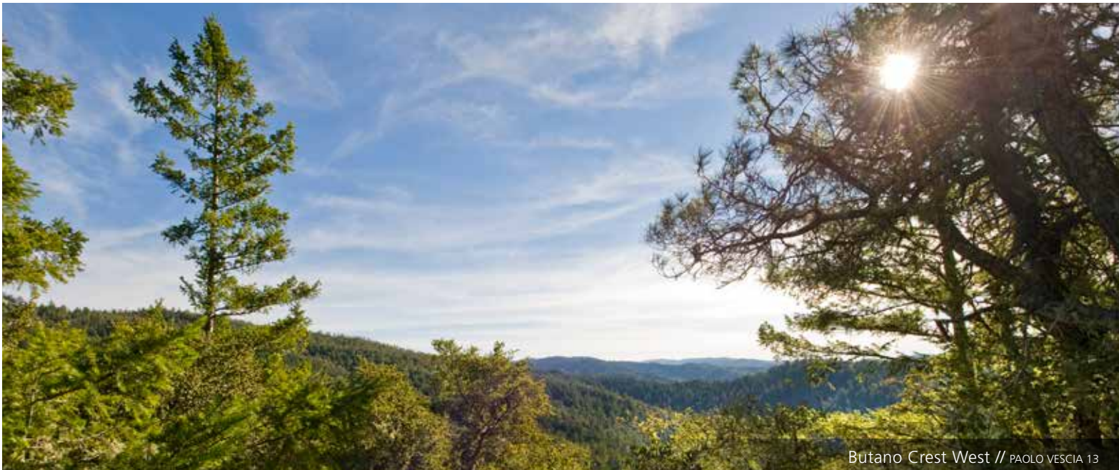
Butano Crest West // PAOLO VESCIA 13