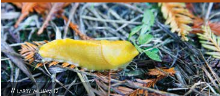
// LARRY WILLIAM 12

Driscoll Orchards has a tiny apple orchard, grazing land and a small but spectacular redwood grove. The property was kept separate from the larger Driscoll Ranch complex protected by POST in 2002. We plan to transfer it to MROSD for inclusion in the La Honda Creek Open Space Preserve.