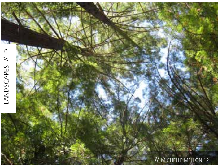
// MICHELLE MELLON 12

These rugged non-contiguous parcels contain chaparral, open grassland and significant areas of redwood forest. We transferred Butano Crest East to San Mateo County Parks in June 2014 to become part of Pescadero Creek County Park. POST continues to own and manage Butano Crest West.