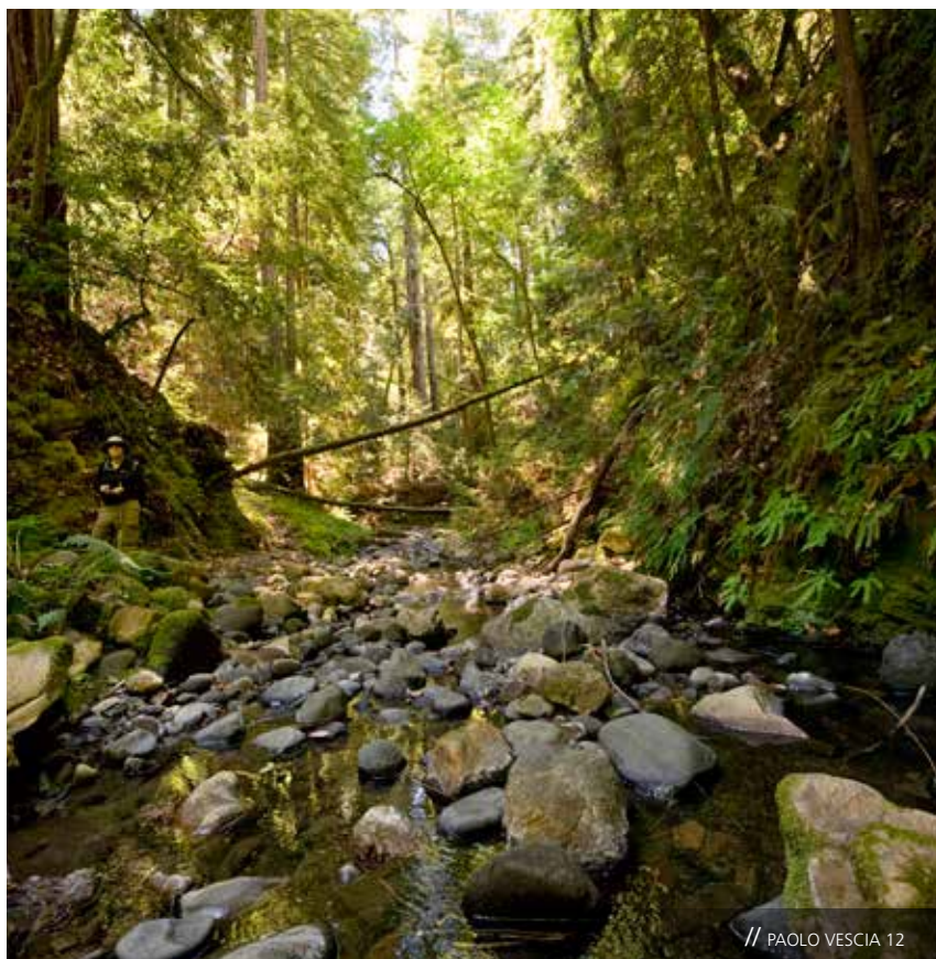
// PAOLO VESCIA 12