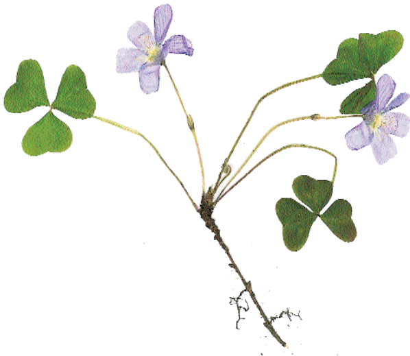
Oxalis oregana REDWOOD SORREL

With interest and management costs, our total expenses amount to $10.5 million. We have raised $3 million from The Gabilan Foundation and a private individual, and expect to raise $5 million from the State of California Coastal Conservancy's Bay Area Conservancy Program, and the Wildlife Conservation Board. We now have $2.5 million left to raise.