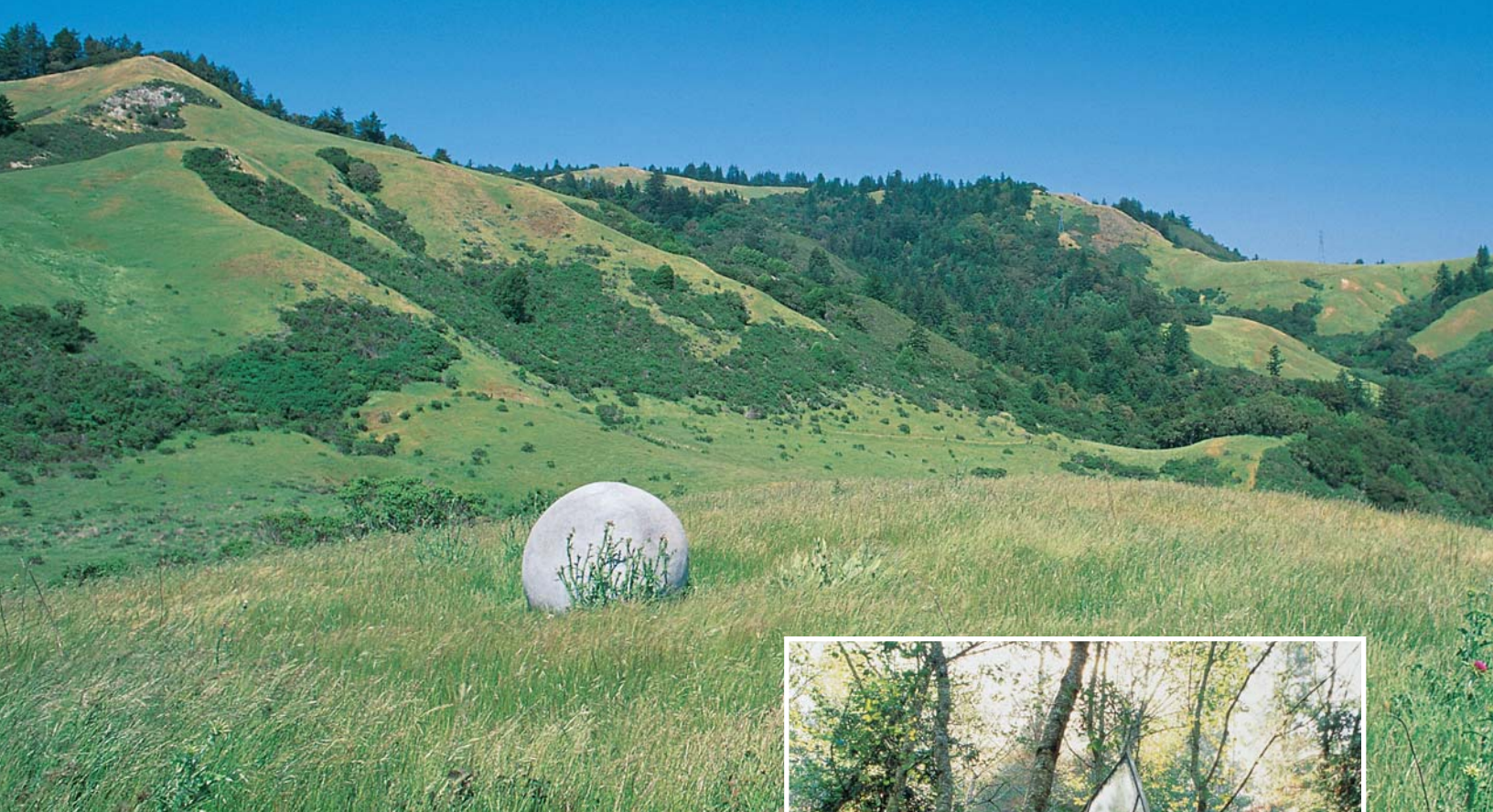
BLACK PEARL, 1990 by Mark Oliver